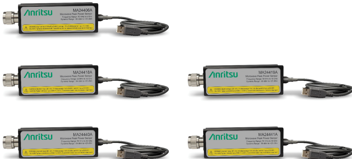
MA244xxA Microwave Peak Power Sensors